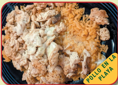
POLLO EN LA PLAYA